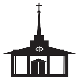
St. Albert the Great Parish