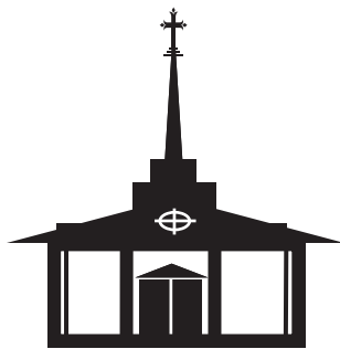
St. Albert the Great Parish