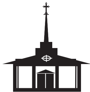
St. Albert the Great Parish