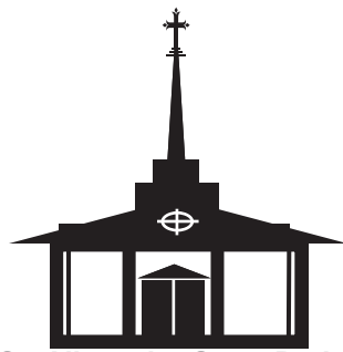
St. Albert the Great Parish