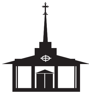
St. Albert the Great Parish