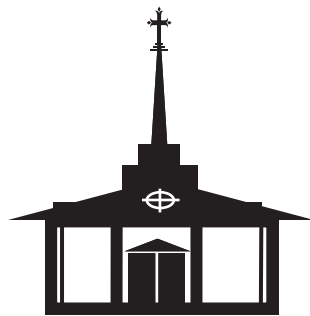
St. Albert the Great Parish